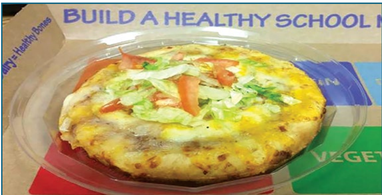
#24500 - Lid for 16 fl. oz. & 24 fl. oz. Invisi-Bowl® 5" Mexican Pizza