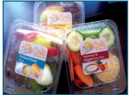
#82612 - 2 Pocket Clear Dipping Container