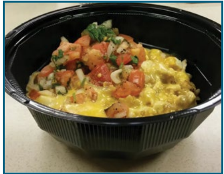
#24025 - 24 fl. oz. Invisi-Bowl® Chipotle Chicken Rice Bowl