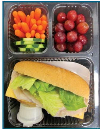
#82725 - Lid Available - Clear