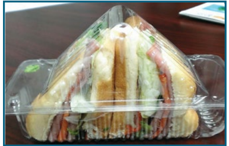
#21507 - Small Sand-Wedge®