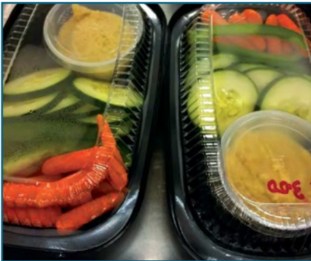
#21361 Medium Combo Platter