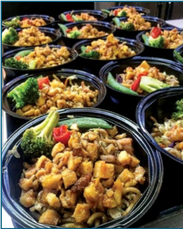
#24017 - 16 fl. oz. Invisi-Bowl® Spicy Noodle Bowl