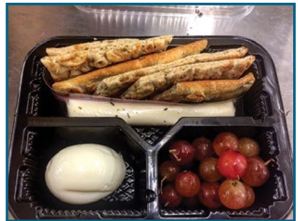
#21903 - Black Snack Tray