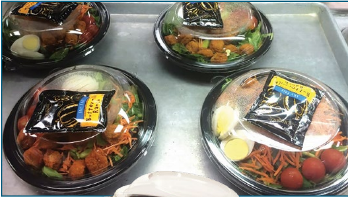
#82638 - 24 fl. oz. Salad Bowl