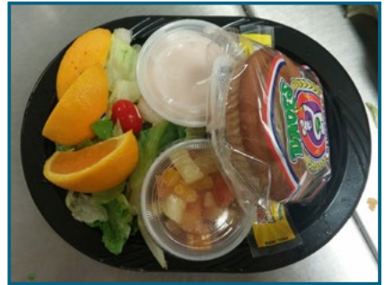
#21972 - One Compartment Oval Platter