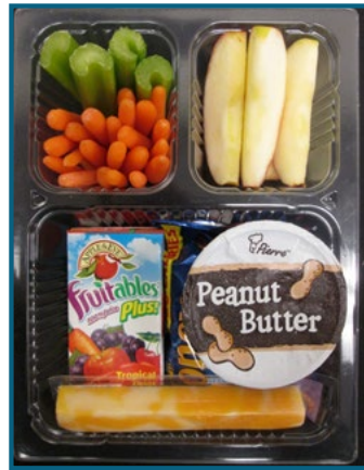
#82723 - Tray - Clear