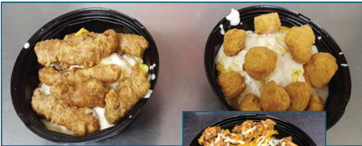
#24013 - 12 fl. oz. Invisi-Bowl® Mash Potato Bowls