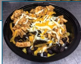
#24013 - 12 fl. oz. Invisi-Bowl® Chicken Burrito Bowl