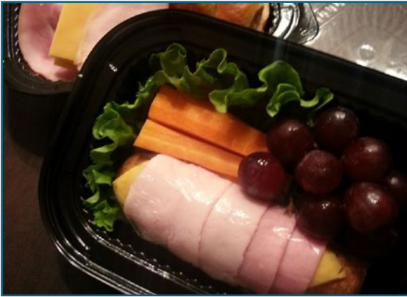
#21121 Small Combo Platter