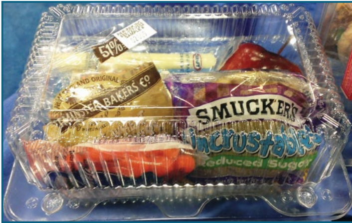
#2009 - Extra Deep Lunch Box