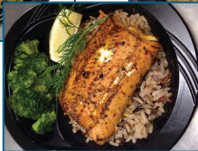
#21954 - Two Compartment Oval Platter