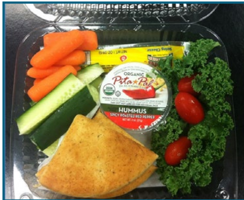
#29167 - Medium Shallow Clamshell Mediterranean Hummus Pack