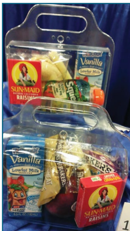
#21552 Lunch Box with Handle