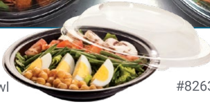
#82639 - Lid for Salad